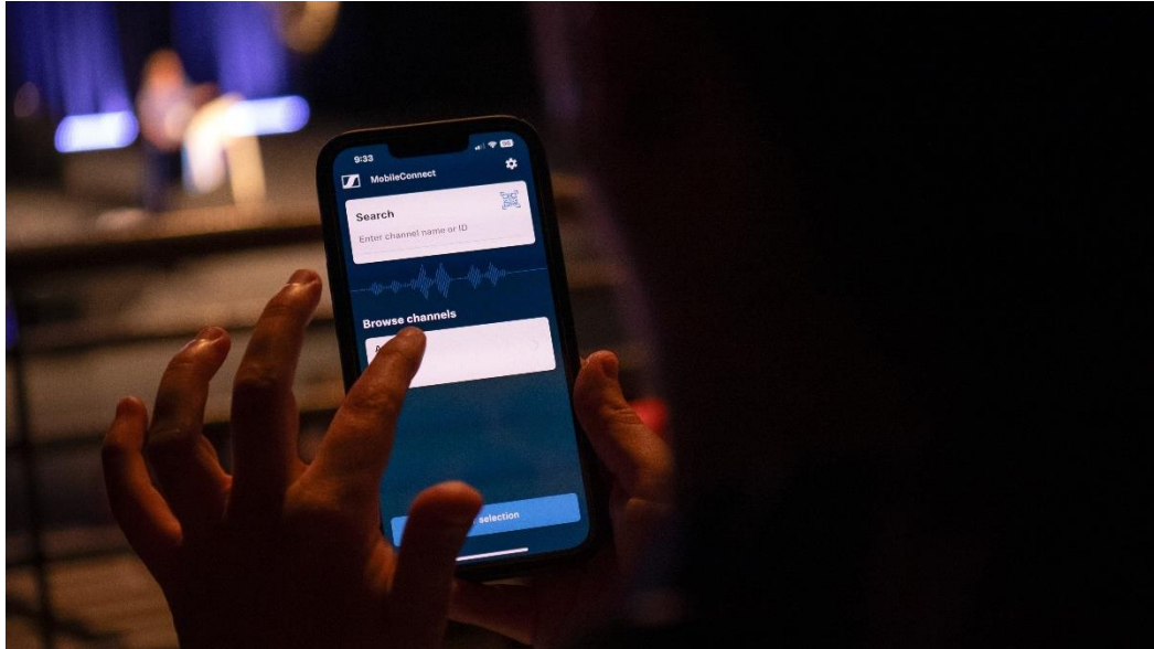
The MobileConnect user interface

leads to frequent dropouts and user issues,” he continued, “We did evaluate all the various options at the Integrate Expo and remained focused on MobileConnect because of its usability, adaptability, and the way it integrates with our existing systems.”